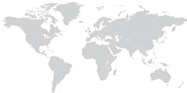
SOUTH AND EAST ASIA