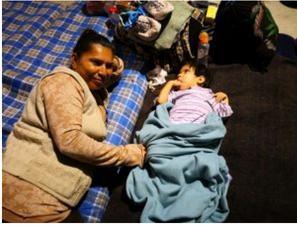
Migrantes con bebés

The phenomenon of mass migration, in which migrants take the road and protect themselves, is new. Up to this point the migrants used the help of coyotes, mostly linked to criminal networks, so they were vulnerable prisoners exposed to kidnappings, extortions, the rapes of daughters, siblings and spouses, and cages in brothels, murders and disappearances. In this new phenomenon, they protect each other, and the humanitarian society covers them with gestures of faithful love to the gospel (because I was a stranger and you invited me in... (Mt 25:43).