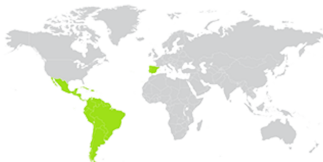
IBEROAMERICA AND THE CARIBBEAN