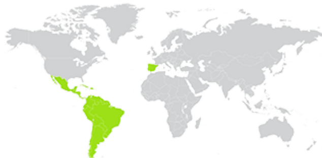
IBEROAMERICA AND THE CARIBBEAN